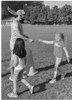
Kindergarteners participate in their first Turkey Trot.

Some events will still look slightly different this year; however, we continue to focus on returning to our roots. OPS is dedicated to finding a balance between putting in place protocols that will keep our community safe and providing the quality educational experience our children deserve. We continue to be a community where strong roots grow.