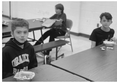
Fifth graders enjoy Soprano's Lunch.

Third Grade Halloween Fun With each day, we proudly continue to find ways to return to our OPS roots. With a full day of instruction, we have increased opportunity to differentiate for individual needs during the WIN (What I Need) instructional period. There is also more time to devote to social-emotional learning through the continued implementation of the Open Circle program, which focuses on the development of a child's self-management, relationship skills, and responsible decision-making. We happily have instrumental, choral, and handbell programs in full swing. Our children are also visiting special area classes regularly. They demonstrate their creativity in the art studio and delve into a new culture and language during world language class. They also visit the science lab where they have the opportunity to bring textbook learning to life, and regularly check books out from the library with the help of parent volunteers. PTA-sponsored lunches have returned to the delight of our parent community. Our student activities,