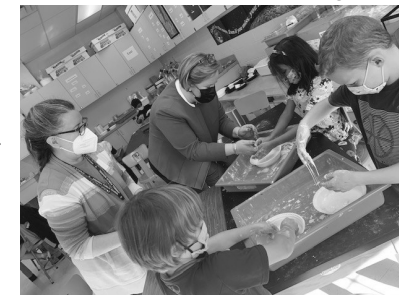
Second graders explore solids and liquids in the Science Lab.

including safety patrol, student government, and math league, are happening onsite each week. We are doing what we believe is best for children – providing opportunities for the whole child to develop.